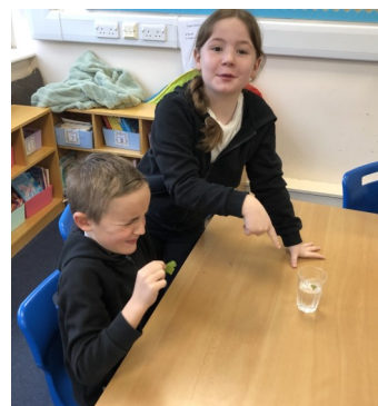
Plate and their significance to the Passover story. They got the

YEAR 3 have been learning about the Jewish Faith in R.E. This week they learnt about the items on the Seder